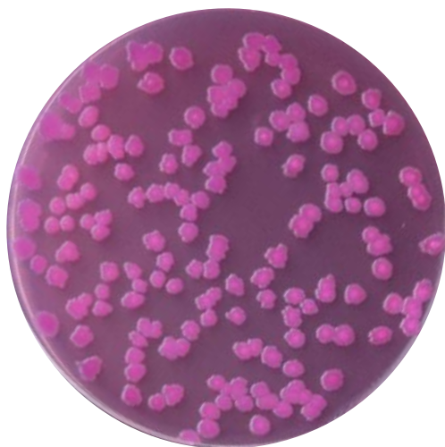
Escherichia coli ATCC 8739